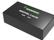
DC-DC Converters (Photovoltaic)