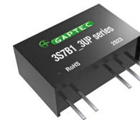
DC-DC Converters (THT)