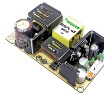
AC-DC Power Supply (Off board - Open frame)