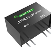
DC-DC Converters (IGBT & SiC)