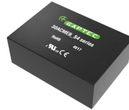
AC-DC Modules (Medical)