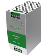
AC-DC DIN Rail (Industrial)