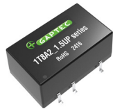
DC-DC Converters (SMD)