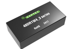
DC-DC Converters (Railway)