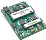
DC-DC Converters (Telecom powers)