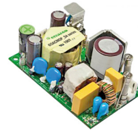
AC-DC Power Supply (Medical)