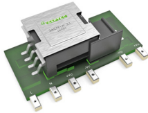
AC-DC Modules (Industrial)