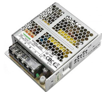
AC-DC Power Supply (Housing)